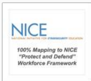
The National Initiative for Cybersecurity Education (NICE)