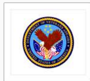
Department of Veterans Affairs